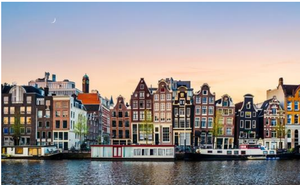
A surface level sunrise view of Amsterdam at dawn

We'd love to feature your picture as our Photo of the Week! Please email a picture of you enjoying retirement, your favorite activity, a great memory, or otherwise to Eric@InvestWithCCG.com with the Subject "Photo of the Week". Thanks!